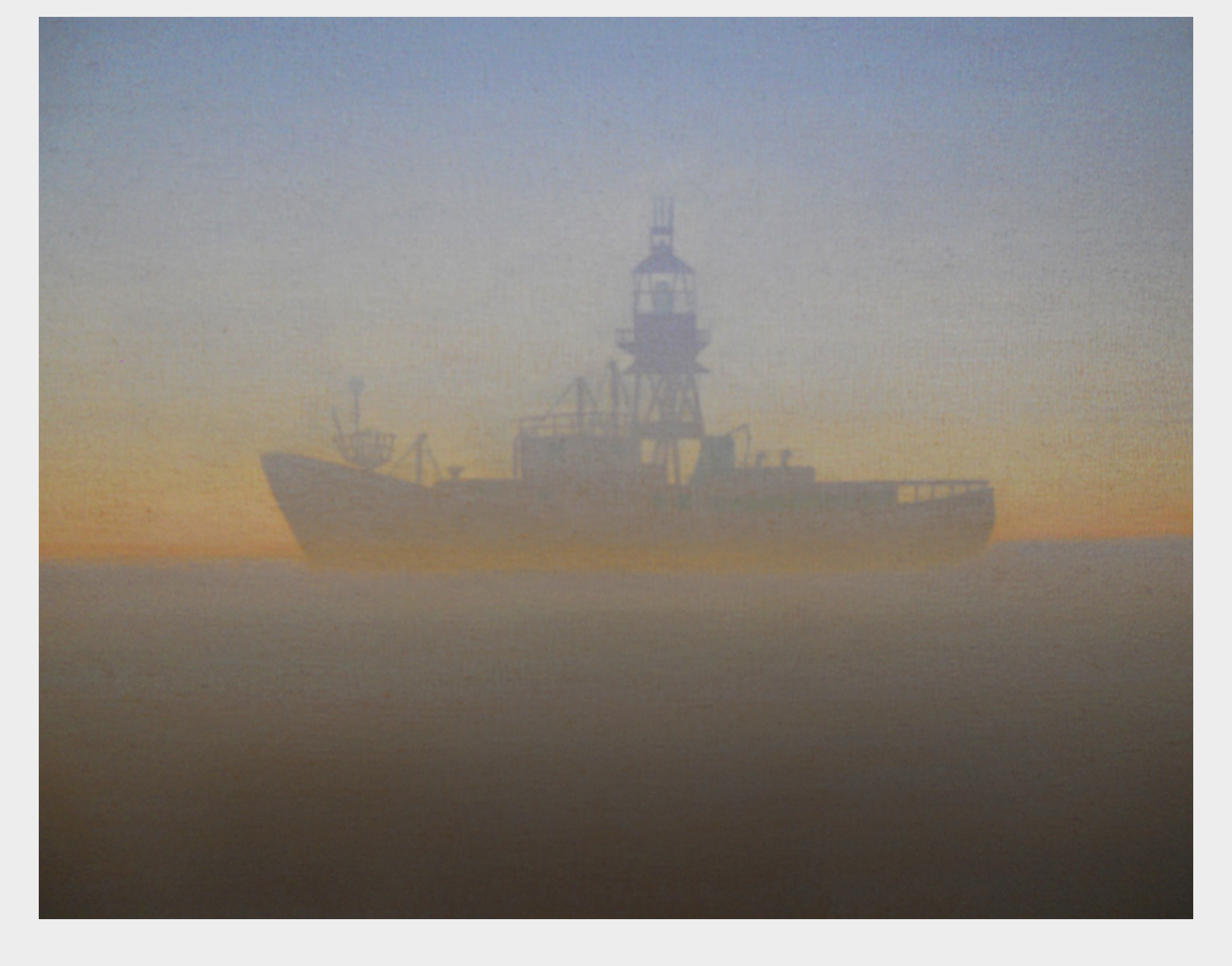
"Estuary at night"