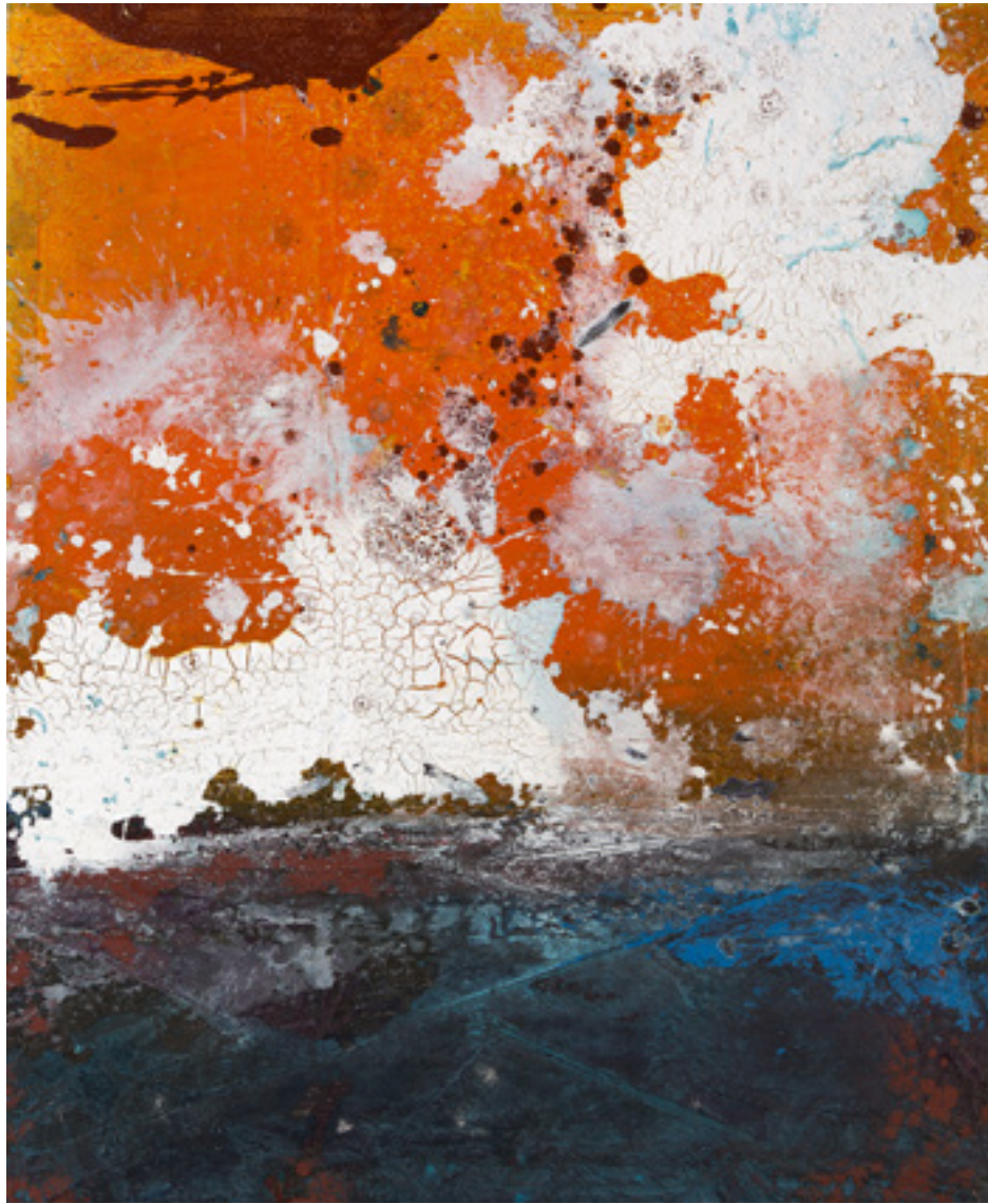
The earth trembles again Oil and mixed media on board 60 x 50 cm