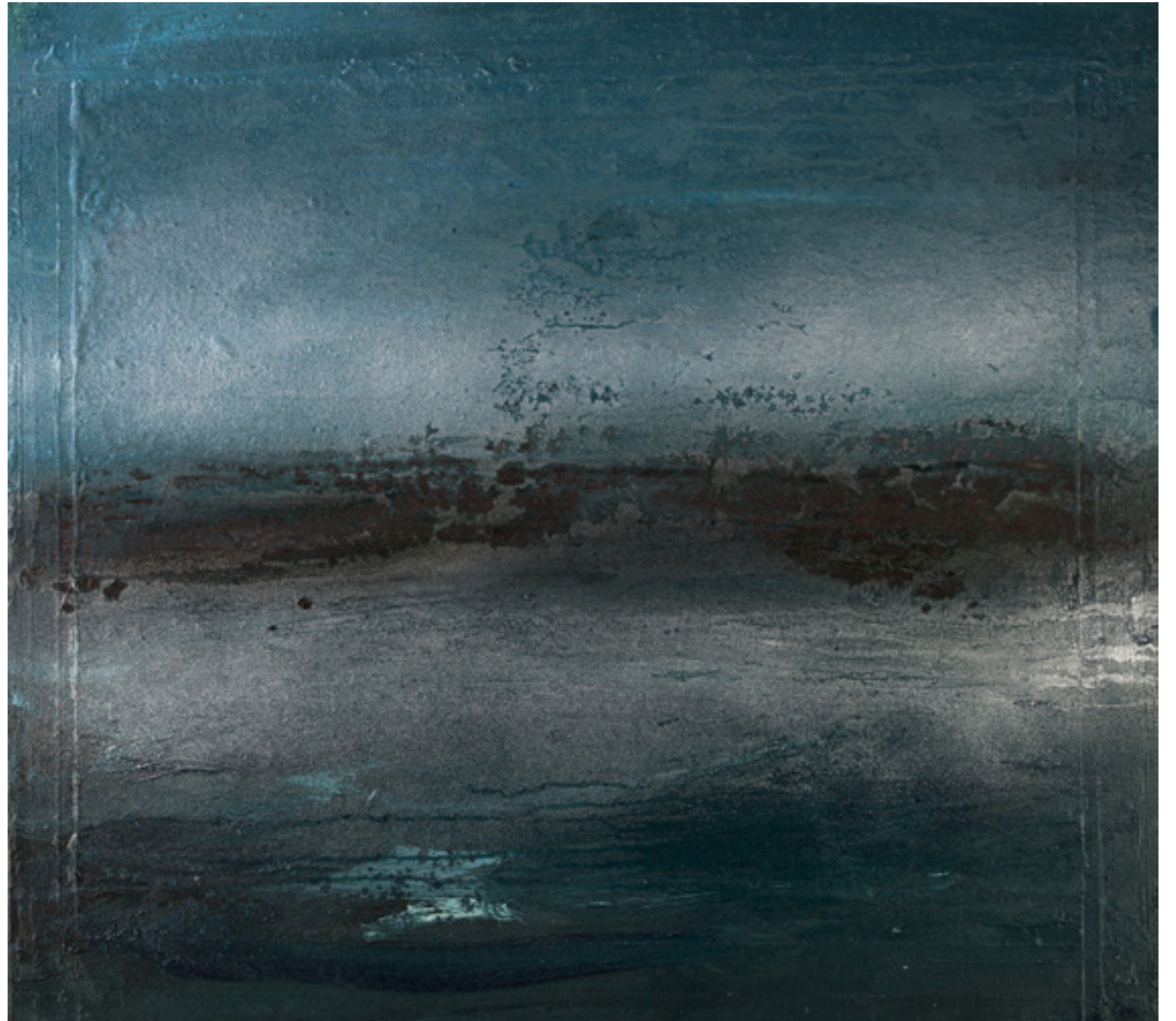
Guiding light Oil and mixed media on canvas 80 x 90 cm