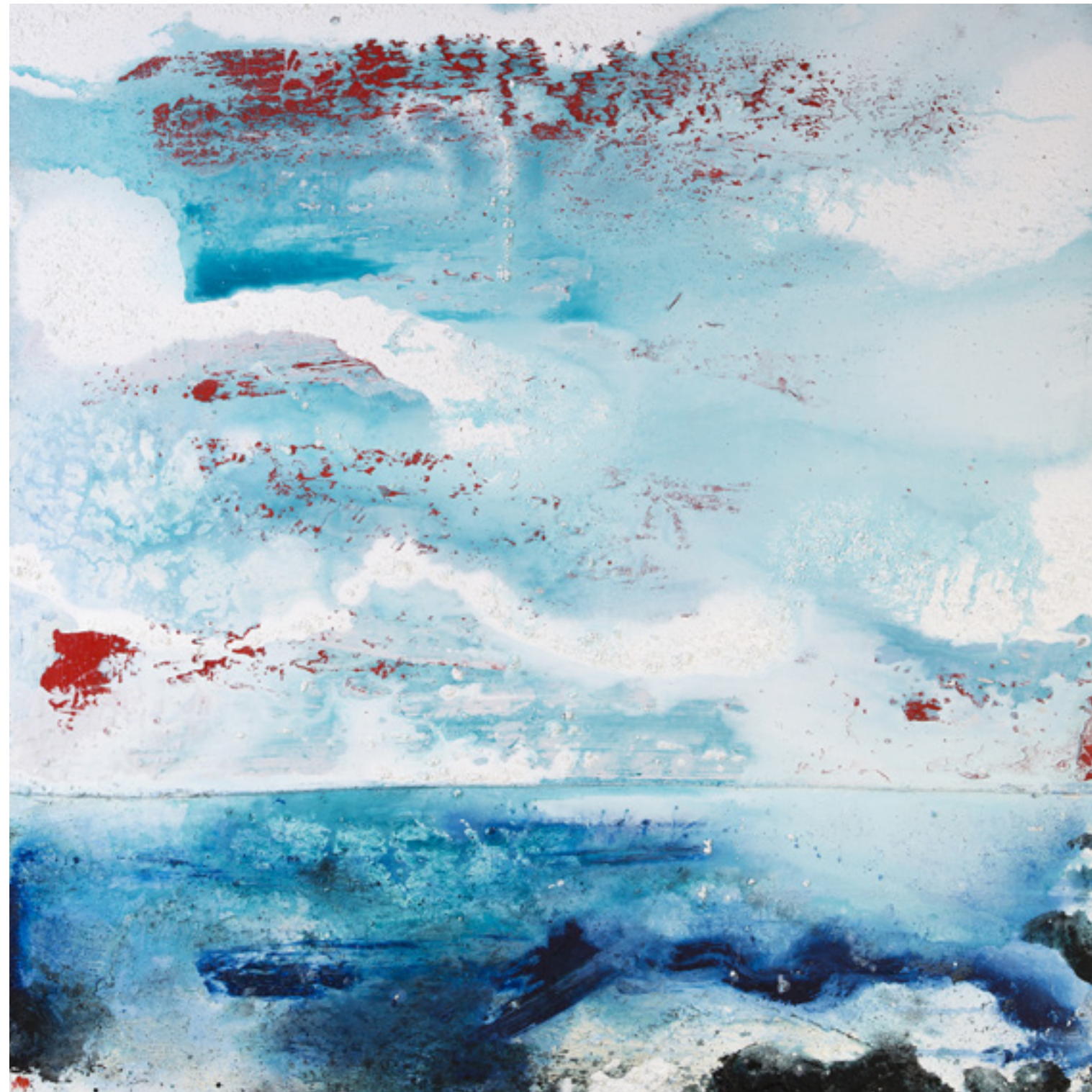
Time and tide Oil and mixed media on canvas 95 x 95 cm