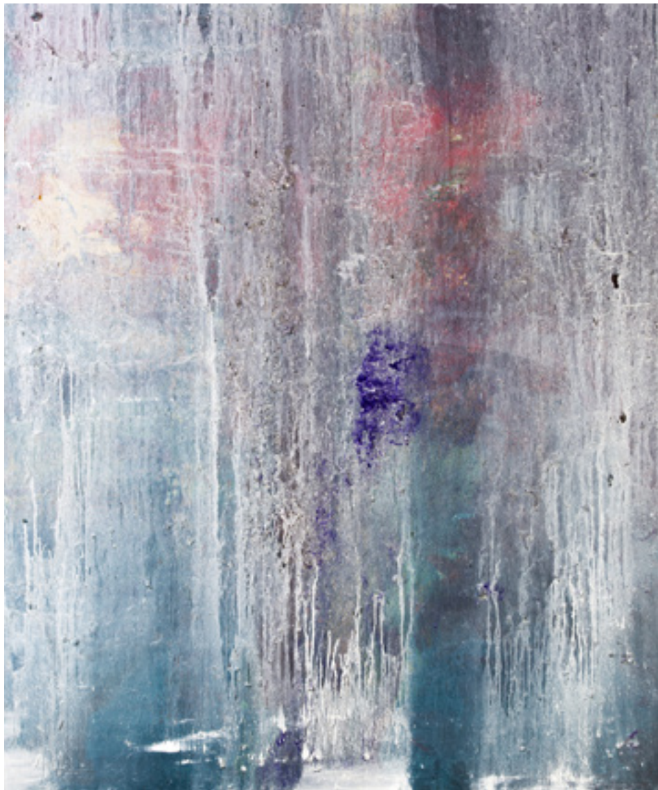
Dreamscape Oil on canvas 120 x 100 cm